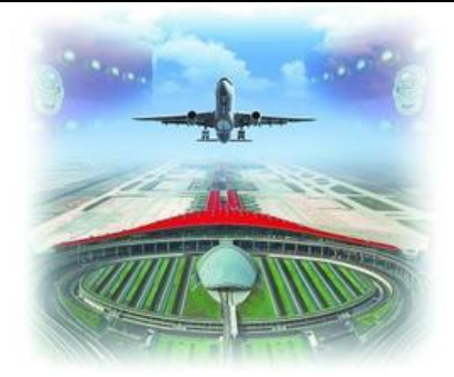
Airport & Taxi from the Airport

Beijing is generally a safe city. However, hang on tight to your wallet especially in crowded, popular tourist sites in tourist cities such as Beijing These tourist cities also has a lot of touts in the streets touting tourist from currency exchange to jewelleries to female companionships. Avoid at all cost!